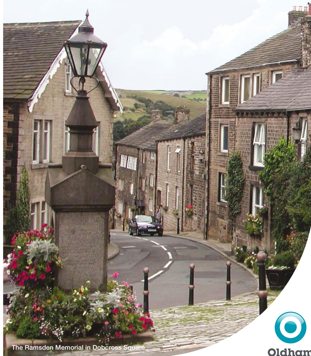
The Ramsden Memorial in Dobcross Square

A great way to explore the historic villages of Saddleworth